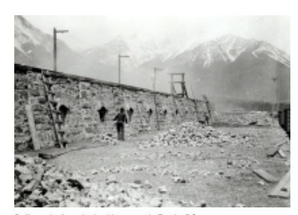
Pulling coke from the beehive ovens in Fernie, BC.

Charging and unloading the Coleman ovens would have been a huge job as there were 216 ovens operating between 1903 and 1918 before the plant was shut down due to poor market demand. Each oven produced over four and a half tons of coke that had to be manually pulled from the oven in a speedy fashion using a fifty pound special iron scraper or "coke puller". Workers determined the oven was ready for pulling by the disappearance of smoke and the dwindling of the rolling flame within the oven, showing that most of the impurities had been burned off.