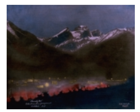
Coke ovens at night. Fernie, BC

Once the coke oven door was opened the coke was quenched by playing water onto the super heated product with a large hose. This quenching only lasted 45 minutes to an hour so as not to cool the oven too much and to ensure that the next charge of coal ignited immediately upon placement. After the coke was pulled out onto the wharf area outside the oven, men with pitchforks would sift the coke to remove ashes and then load it into boxcars. This was a laborious process requiring much stamina and only the strongest men were able to endure this tedious work.