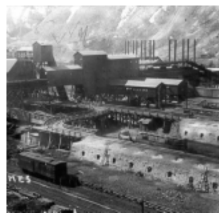
Michel: track system from tipple to beehive ovens.