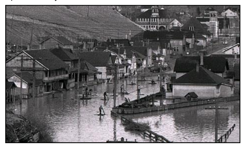
Coleman rafting in Italian Town during 1942 flood.

People of Pass towns are emerging from the worst flood in its history. A deluge of rains that continued from Saturday to Wednesday brought stream s up to overflow their banks. Lyon Creek was the main threat to Blairmore, its mad torrents covering most of the eastern and southern sections of the town. Main street bridge failed to withstand the pressure and collapsed Tuesday. Shortly afterwards the State Street [present 21 Avenue] bridge over Lyon Creek became impassable as the waters made inroads around the east approach. Just before the main street bridge collapsed, the town service truck smashed through the undermined