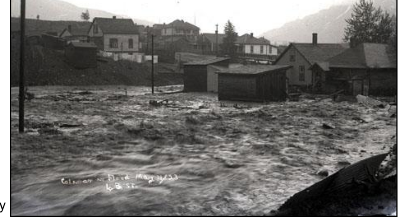
In the great flood of 1923, a nine-year-old boy was swept away and drowned. The June 7, 1923 edition of the Blairmore Enter-prise states