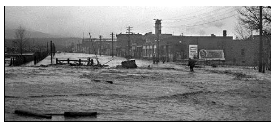
Lyon Creek in flood 1942 Blairmore.

At Coleman a similar condition prevailed, with some houses moved from their foundations. Nez Perzie [sic], Star and McGillivray creeks were Hillcrest also in flood. suffered when the Hillcrest creek went on the rampage, threatening the entire town. At Frank Gold creek came down with great fury, threatening the traffic bridge near the depot, as well as the