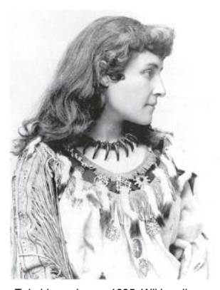
Tekahionwake ca. 1895.