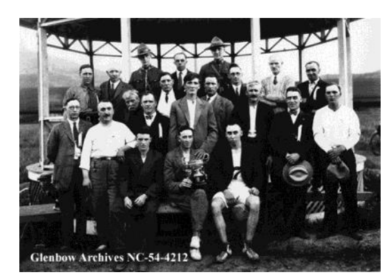
Men from quoiting club sitting in front of the bandstand ca. 1925. Quoiting was a game a bit like horseshoes but with metal, rope or rubber rings rather than horseshoes.