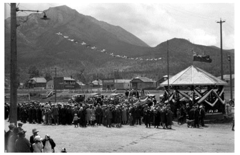
Award ceremony after annual footrace from Blairmore to Coleman. 1930.