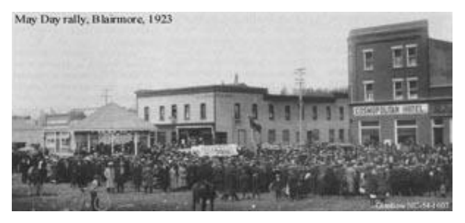
Coal miners' demonstration. May 1st, 1923.

ebrations. One of the first major events was the Armistice Day celebration in November 1921 which commenced at the bandstand. In 1927 it was the focal point, along with an arch spanning Victoria Street, for the local celebration of Canada's Diamond Jubilee of Confederation (1867 – 1927) which included a five-mile road race with the runners starting and finishing at the bandstand.