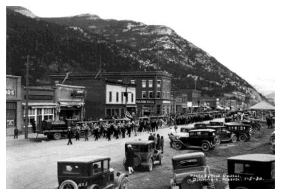
May Day demonstration on Victoria Street (Main Street). May 1, 1930. Gushul Studio. Glenbow Archives NC-54-4364. Bandstand is middle right.

The 1940s brought a new task to the bandstand, that of supporting the war effort. After extensive renovations the bandstand was used for rallying speeches in support of the victory loans program throughout the war. It was also a focal point for end-of-war celebrations. During the war, the National Film Board used the bandstand in a film on the coal industry.