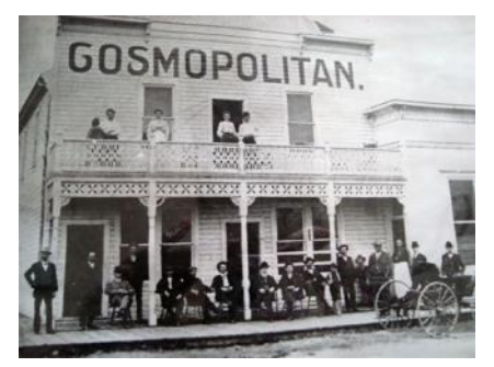
The original wood hotel that burned in March 1912.. The Cosmopolitan Hotel website.

Why not drop into the Cosmopolitan for lunch or a pint of beer in the evening and try and imagine what it would have been like in 1912. The Cosmopolitan today is one of the iconic buildings of Blairmore's Main Street. Its owners are preserving its historic feel.