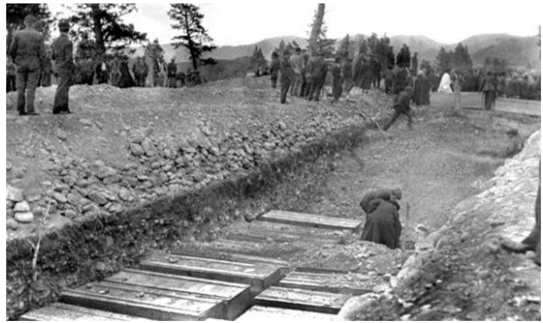
Hillcrest Graves.