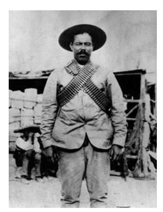
Pancho Villa.