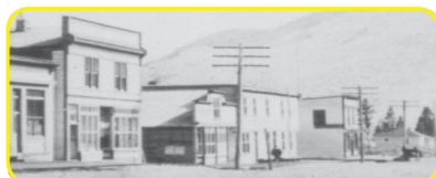
Frank's Dominion Avenue After the Slide

For more information on the Frank Slide and the fascinating history of the Crowsnest Pass, visit the Frank Slide Interpretive Centre .